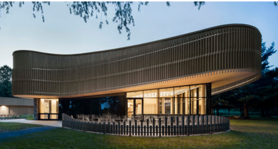
THE PARC NATIONAL DES ÎLES-DE-BOUCHERVILLE DISCOVERY AND VISITORS CENTRE ÎLE STE-MARGUERITE, QC