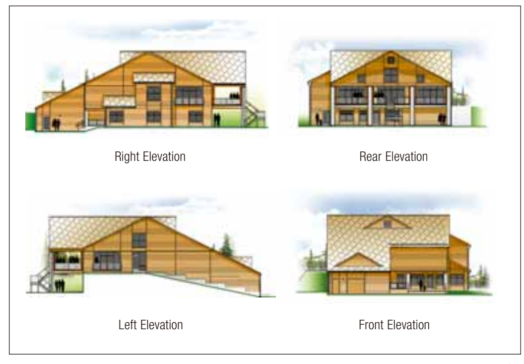
Figure 21 Elevation views of the Clubhouse

Easily accessible, the first storey houses various services offered to the players (change rooms for men and women, the pro shop, administration offices, etc.). An 18.5 x 17.5 m (61 x 57 ft) reception hall with a capacity for 160 people occupies the majority of the second storey. Seated within the hall or from the exterior deck ( Figure 22 ), visitors can admire the beauty of Lac St-Jean and the golf course. The second storey also houses reception-related services such as the bar, commercial kitchen, washrooms, and storage. There is also a small office space for tournament management.