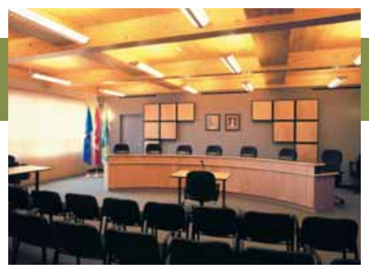
Figure 10 Town of Hinton Council Chamber

A wall system with an effective R-value of R-20 and roof system with an R-value of R-30 offsets the demand for winter heating. The wood-frame construction used throughout the building was easily and cost-efficiently insulated to provide the needed effective R-value within the building