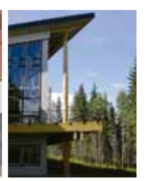
Figure 7 Main entry bridge