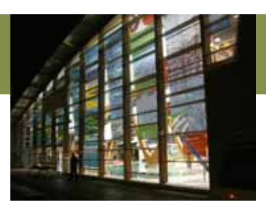
Figure 4 Night view into the new pool

The West Vancouver Aquatic Centre is sprinklerprotected. A building of this size is required to be of noncombustible construction. However, with the building sprinklered, the roof assembly and its supports are permitted to be heavy timber construction. As such, the glulam beams and supporting columns were left exposed, and no additional fire protection was required.