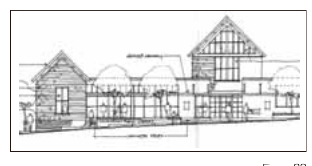
Figure 29 Front elevation showing varied roof lines

Building with wood was especially appropriate for downtown Courtenay because forestry is one of the most important economic sectors of the community. Wood both satisfied building code requirements for structural integrity, and offered economic and aesthetic advantages. The new library serves as an example and inspiration of how to combine the many traditional wood buildings with a modern design.