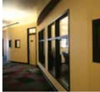
Figure 27 Concrete-topped floors and irregular room shapes provide rigidity and interest