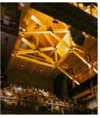
Figure 13 Auditorium roof structure

Figure 12 Stage and ground floor seating