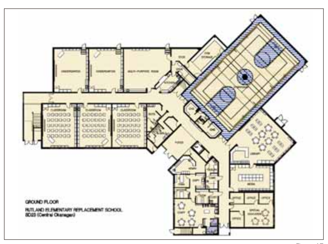
Figure 17 Ground floor plan

The building configuration and the selection of materials for the Rutland Elementary School in the Central Okanagan ( Figure 16 ) area of British Columbia was determined by an extensive design and value analysis process focused on economy, efficiency, durability, and sustainability. The 3,000m<sup>2</sup> (32,500 ft<sup>2</sup>) school ( Figure 17 ) employs several design innovations to address evolving needs and priorities in both the teaching environment and longterm maintenance. Building systems were selected for each individual element based on appearance, durability, cost and sustainability. The building responds well to the provincial sustainability guidelines.