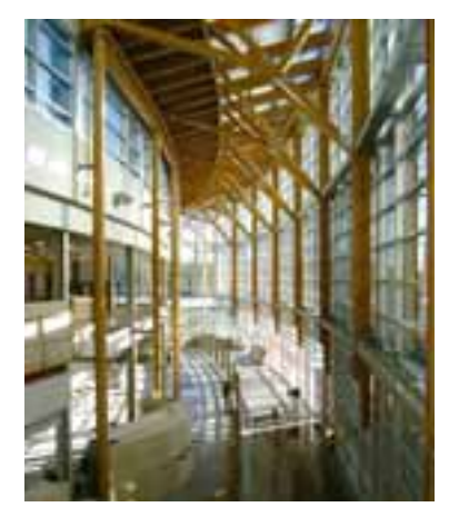
Figure 33 Glulam structure provides a bright, roomy atmosphere for the main public corridor

Completed in January 2004 after 3 1/2 years of construction, the 60,000 m<sup>2</sup> (640,000 ft<sup>2</sup>), 375-bed acute care facility ( Figure 32 ) is the first hospital in Canada to use wood extensively throughout the structure of the main public areas. In doing so, it provides a bright and optimistic atmosphere for patients, staff, and the community it serves.