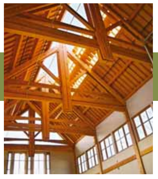
Figure 30 Bright, open roof structure in the main entry