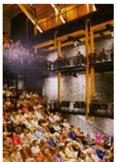
Figure 14 Raised and suspended auditorium seating

trees, pine beams and granite from the local quarry add a special intimacy to the interior of the concert hall ( Figure 12 ).