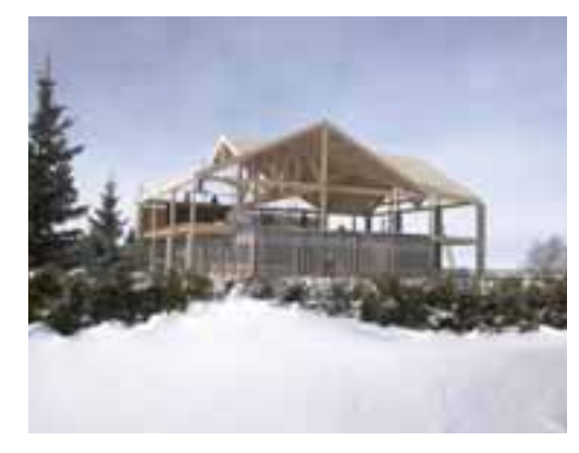
Figure 22 Wide overhang shelters the verandah