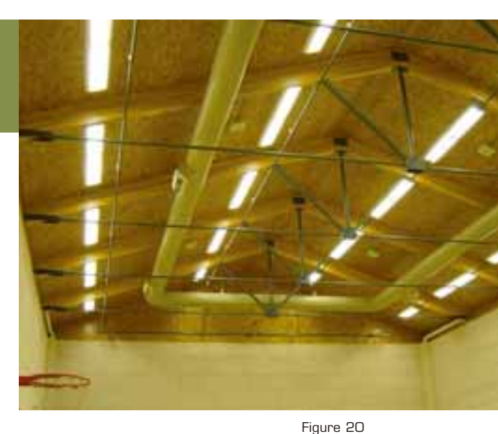
View of the glulam-tied roof, lighting and ventilation

The Rutland Elementary School employs many innovations designed to provide a quality educational environment while minimizing the environmental effects of the building's construction, operation, and maintenance.