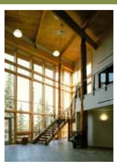
Figure 9 Main lobby atrium