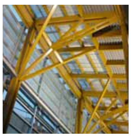
Figure 34 Detail of the glulam roof trusses and struts

Main Public Corridor – The 7.5 m (25 ft) wide by 140 m (460 ft) long public corridor is made of Douglas fir glue-laminated members ( Figure 34 ). The 300 mm (12 in) diameter interior columns are spaced at 9 m (30 ft) and support