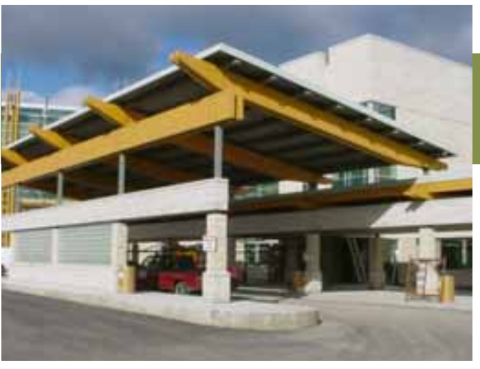
Figure 36 Glulam entrance canopy