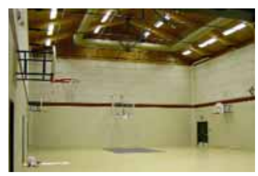
Figure 19 The small gym combines block walls and a wood roof

The ground floor walls are urethane-insulated masonry bearing walls, while the upper floor walls are primarily wood frame. The roof structure uses long-span structural insulated panels (SIPs) supported by wood beams and trusses ( Figure 20 ). The use of sloped roof forms provides larger interior volumes within upper