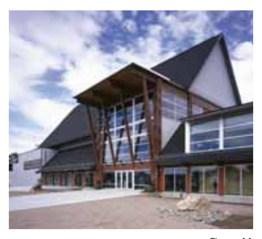
Figure 11 Main entrance

With strong community support and the tireless efforts of numerous Parry Sound and area citizens, the Festival of the Sound now has a breathtaking new edifice in the Charles W. Stockey Centre. More than 40 partners were drawn together for this project, including all area municipalities, the provincial and federal governments, and the private sector.